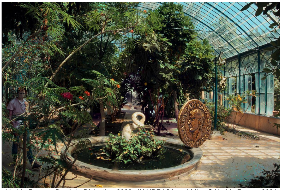
Hedda Roman, Death to Dialectics , 2023, 4K HDR Video, 4 Min., © Hedda Roman 2024, Courtesy of the artists; Sies + Höke, Düsseldorf