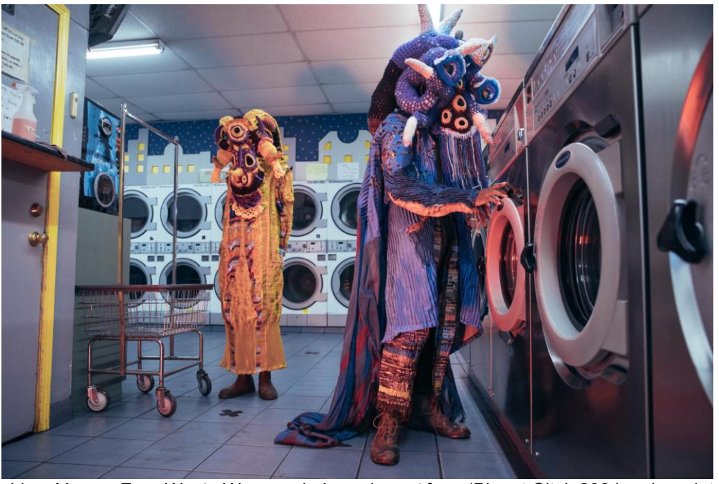
Liam Young, Zero Waste Weavers in Laundromat from 'Planet City', 2024, color print