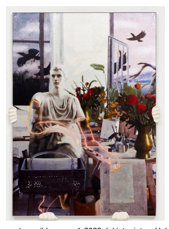
Hedda Roman, The longest possible game 4 , 2023, Inkjet print on Hahnemühle Photo Rag Metallic, mounted on Alu Dibond, fabric frame and synthetic resin handle, © Hedda Roman 2024, Courtesy of the artists; Sies + Höke, Düsseldorf